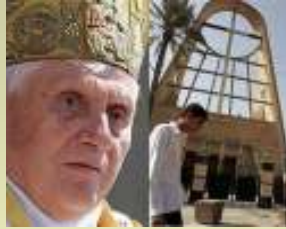
Pope Benedict XVI